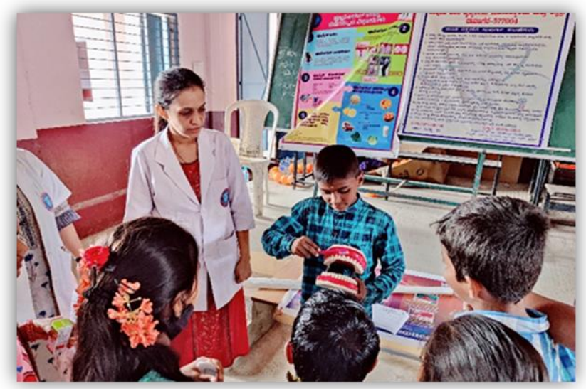
TOOTH BRUSHING DEMONSTRATION AND PEER BASED LEARNING